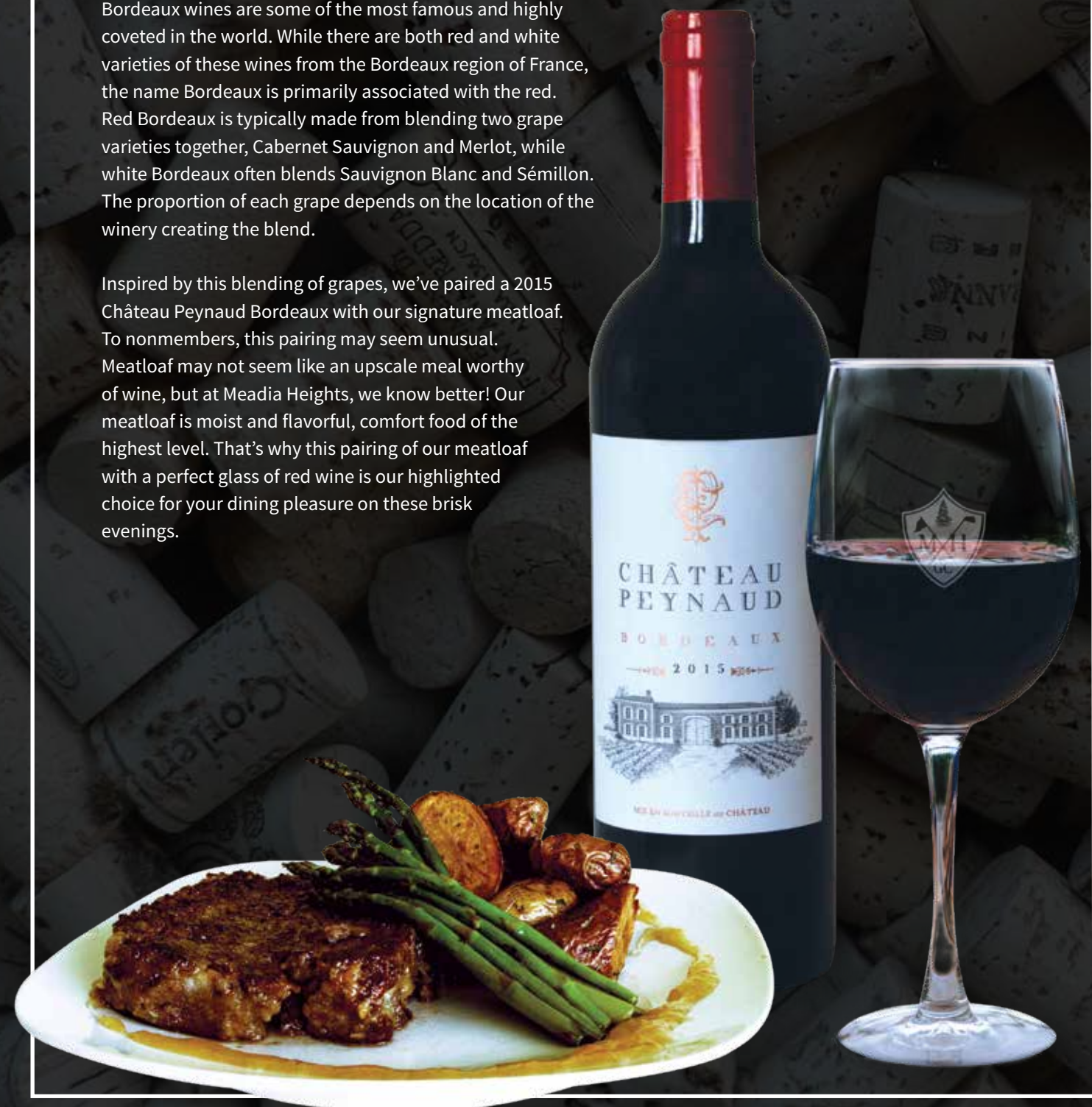
MEADIA HEIGHTS MEATLOAF